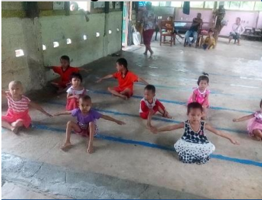
Ensuring Social Distance